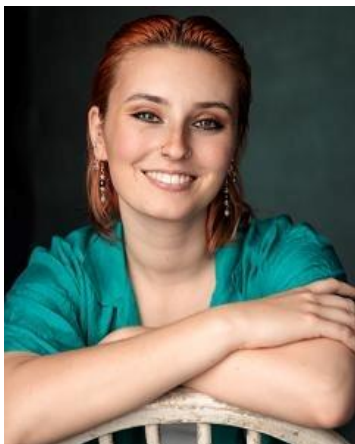
Mo Crook Actor